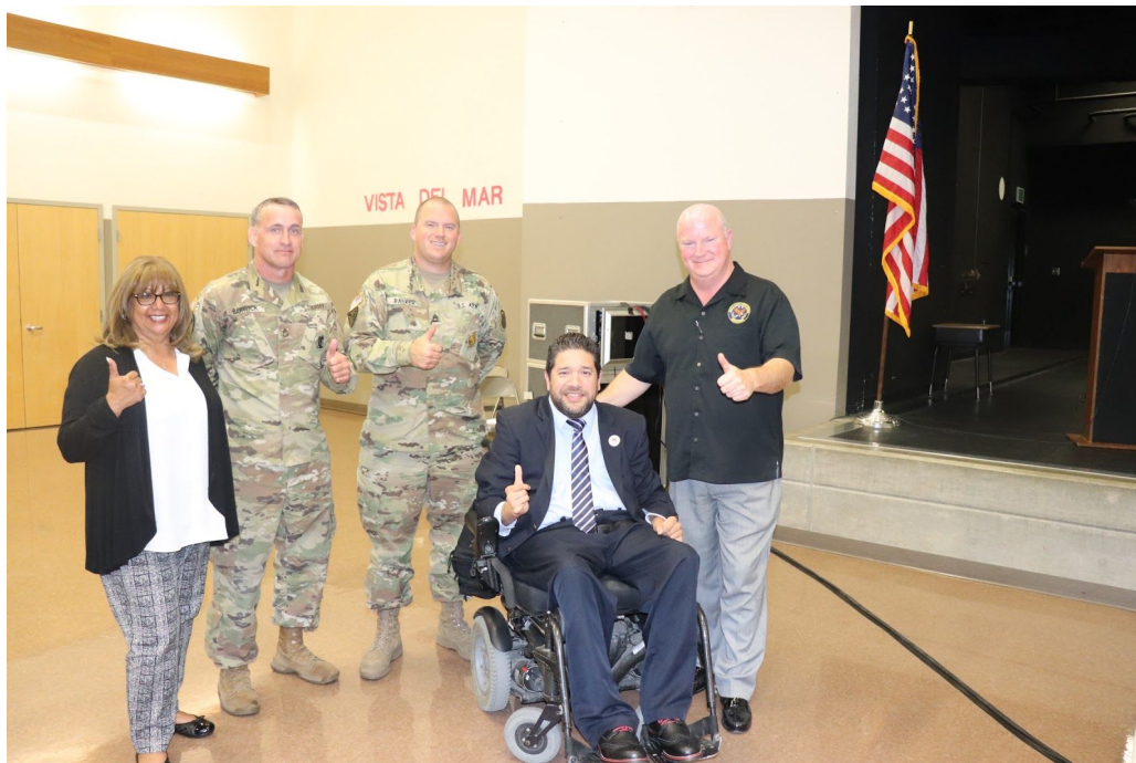
(Above picture taken at the April 11, 2019 Board Meeting)